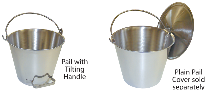
Pail with Tilting Handle